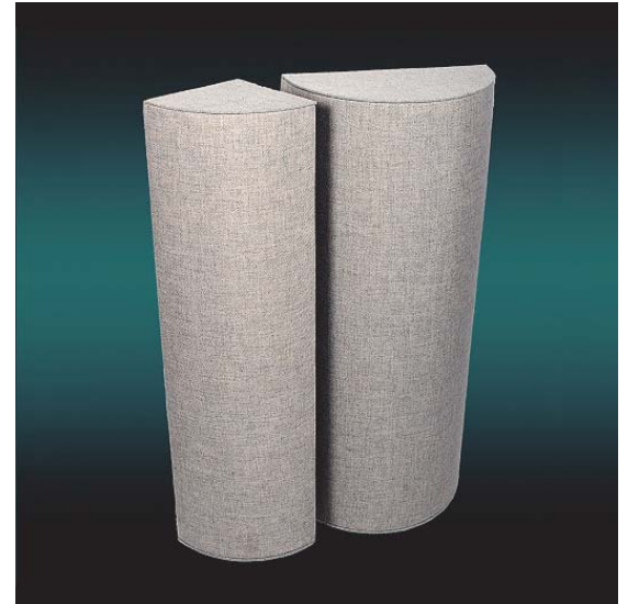
Sound Absorption Coefficient – Half Round

Size: Half (1/2) Round – 24” Diameter Quarter (1/4) Round – 12” Radius Lengths: 48”, 96” (Custom lengths available) Fabric: Guiford of Maine® FR701 Style 2100 Mounting: Z-Clips Fire Rating: Class A