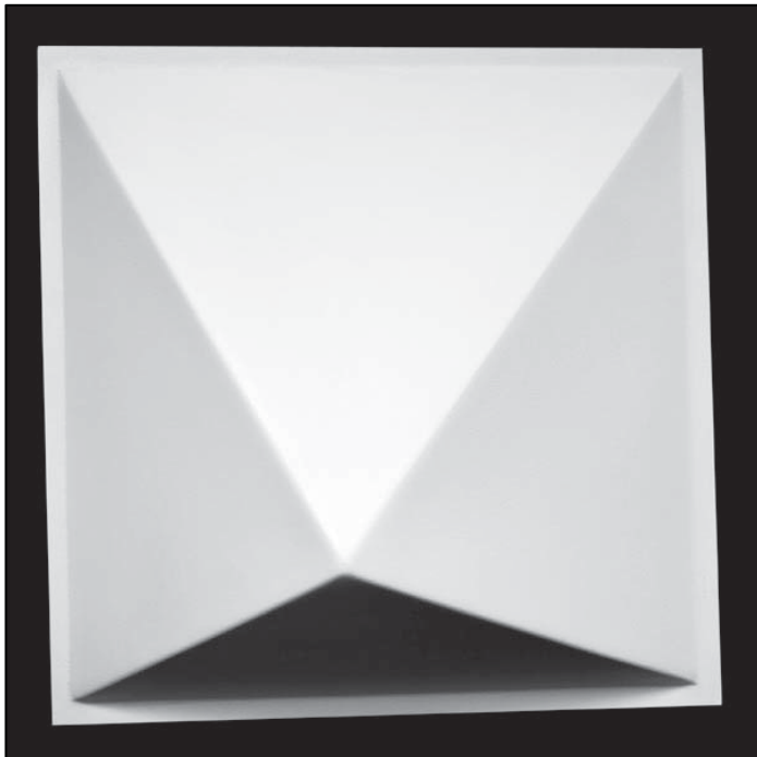
Grid Mount Pyramidal Diffuser

*Note: Diffusion data available upon request